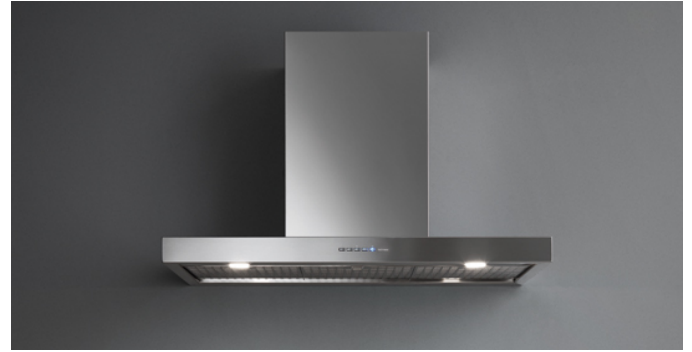
The photograph is purely for information It may not correspond to the selected version.